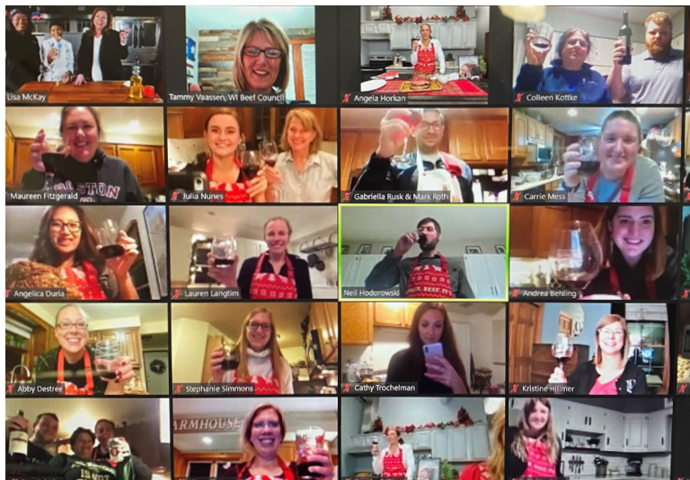
ABOVE: Wisconsin food bloggers, food media and agricultural influencers wear their festive Beef. It's What's for Dinner. aprons and share a toast to Wisconsin's beef industry during the virtual 'Roast & Toast' event.