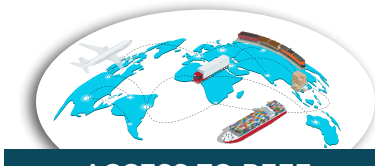
ACCESS TO BEEF EXPORT MARKETS