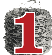
ROLL OF BARBED WIRE