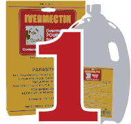
BOTTLE OF POUR-ON DEWORMER