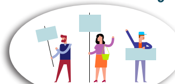
ANIMAL RIGHTS ACTIVISTS