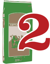
BAGS OF MINERAL